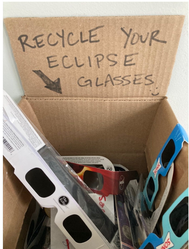
Recycling Solar Eclipse glasses – a big “Thank You” to Margaret Berges for arranging to have our recently used eye protection sent to nonprofit organizations in other countries where future solar eclipses can be enjoyed – recycling on a cosmic scale!

Want to help make the Brown Bag lunch program work? You too can help to make the MSH lunch program a success whenever you shop for your own groceries. We fundraise to purchase supplies for this effort with our Shopping for Justice program (S4J), where we ask you to purchase grocery cards from local chain stores for your personal shopping needs. We buy the cards in bulk, and get a 5% discount, which funds the lunch program (your grocery purchases are one-to-one, dollar for dollar, since the 5% donation comes from the stores). Stop by the Social Justice Table in the Vestry during Coffee Hour to learn more about this user-friendly program. The more UCS consumers use the S4J program, the more resources we raise that can be directed to helping address local food insecurity. Since we all shop for groceries and supplies at some point, doing it with S4J cards is an easy way to extend our work to alleviate hunger in our own backyard. Thank you for supporting Shopping for Justice!