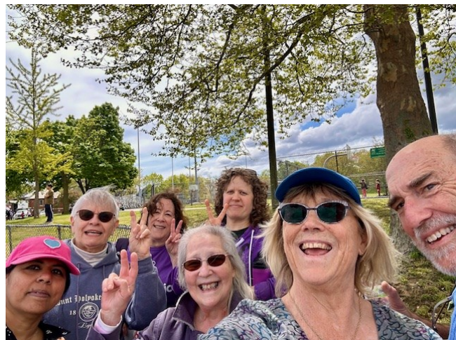
Some of the UCS crew at the end of the 4.3-mile Walk for Peace on a beautiful Mother's Day morning in Dorchester.